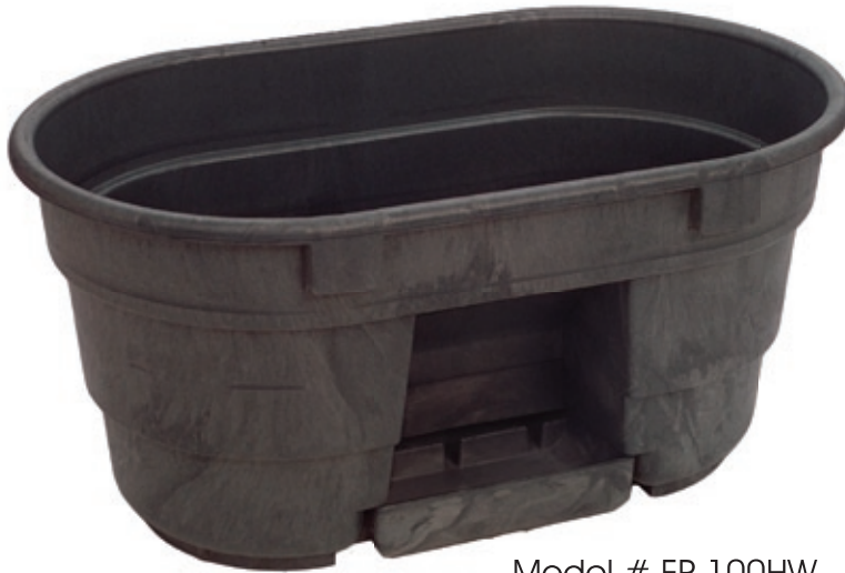
Model # FP 100HW